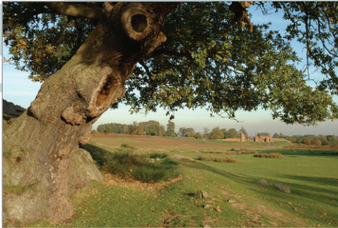
Bradgate House in Bradgate Park An old oak tree frames the ruins of Bradgate House, the birthplace of Lady Jane Grey, the Nine Days Queen.