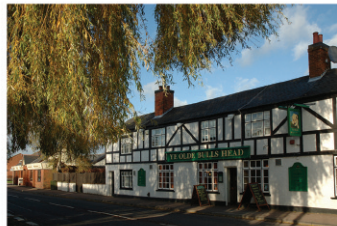
Broughton Astley The half-timbered facade of the Ye Olde Bulls Head pub hides under the canopy of a large weeping willow.