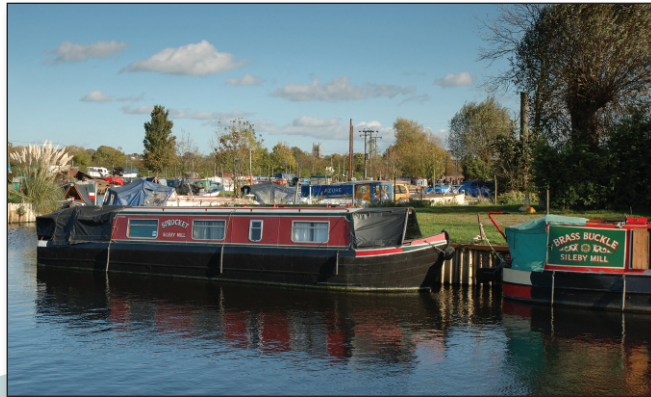
Right: Narrowboats moored on the River Soar at Sileby Mill with the village of Sileby in the distance.