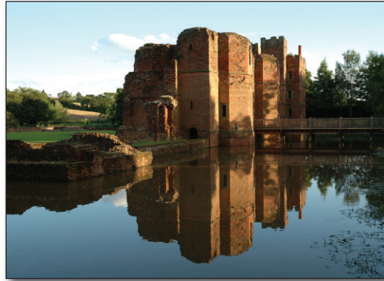
Kirby Muxloe Castle.