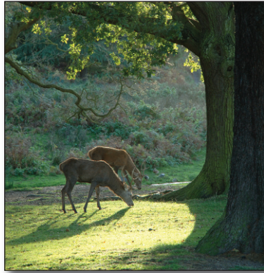
Bradgate Park. Deer graze in the idyllic surroundings of Leicester's largest and most popular Country Park.