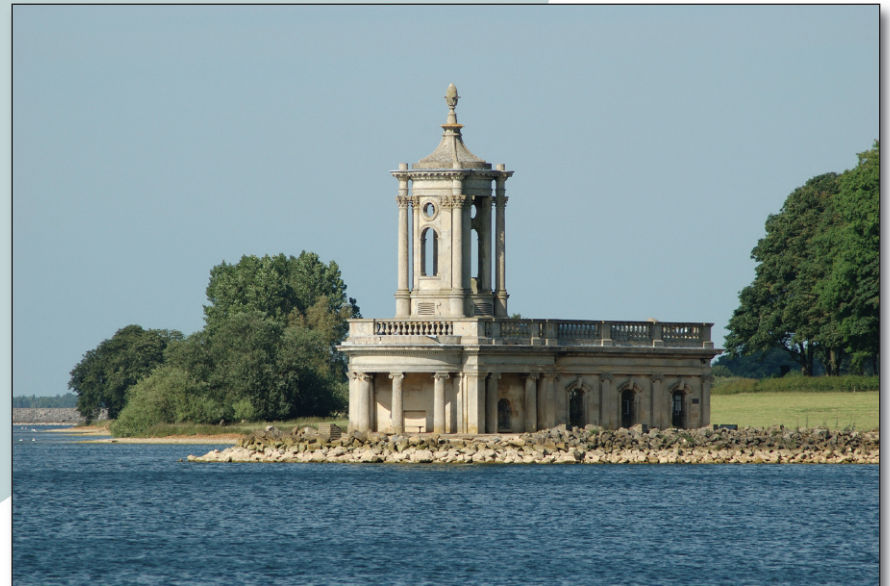
Normanton Church, Rutland Water.